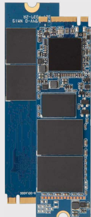
M.2 SATA SSD